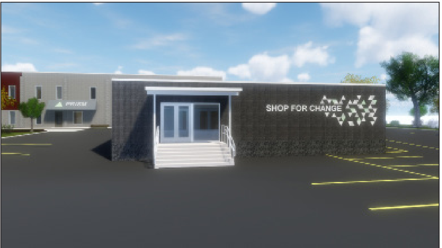
rendering of front entrance and Shop for Change Thrift Shop store front at new location