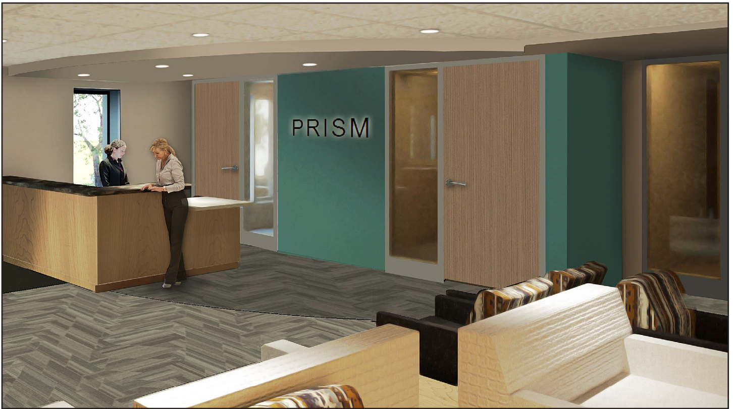
rendering of reception area in new location